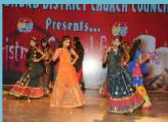
Diwali & Christmas Celebration