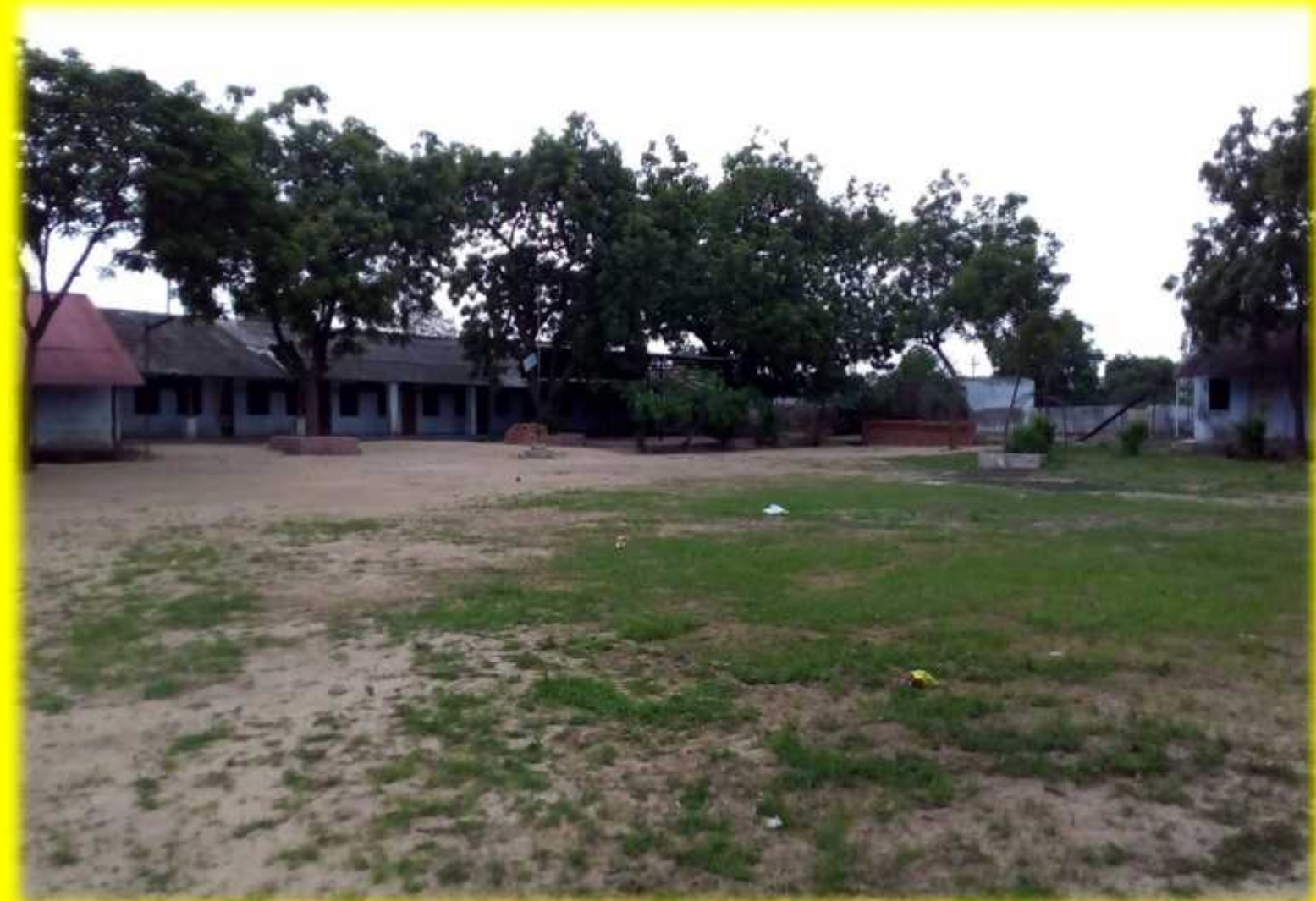
SCHOOL & SCHOOL CAMPUS